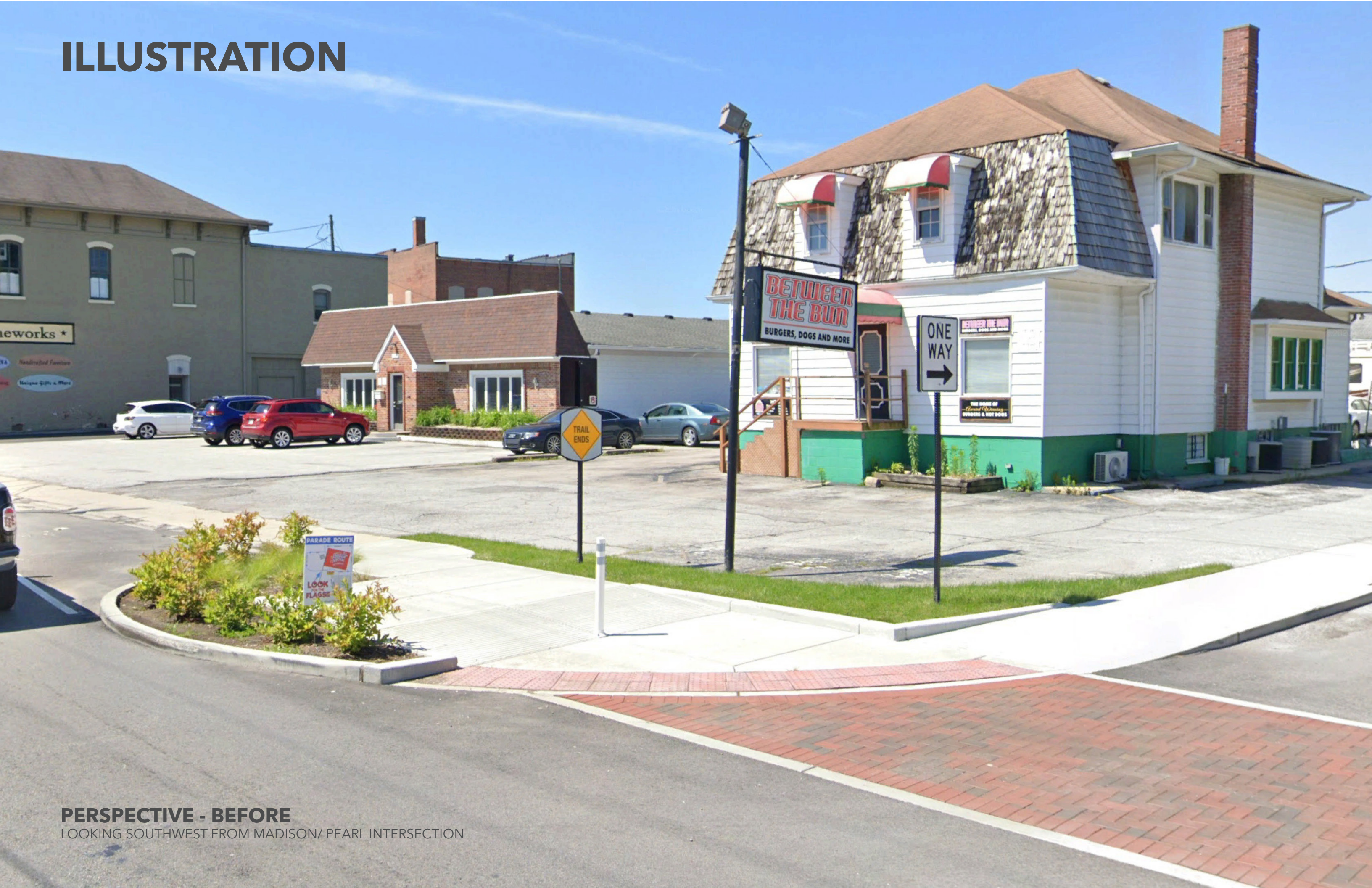
PERSPECTIVE - BEFORE LOOKING SOUTHWEST FROM MADISON/ PEARL INTERSECTION